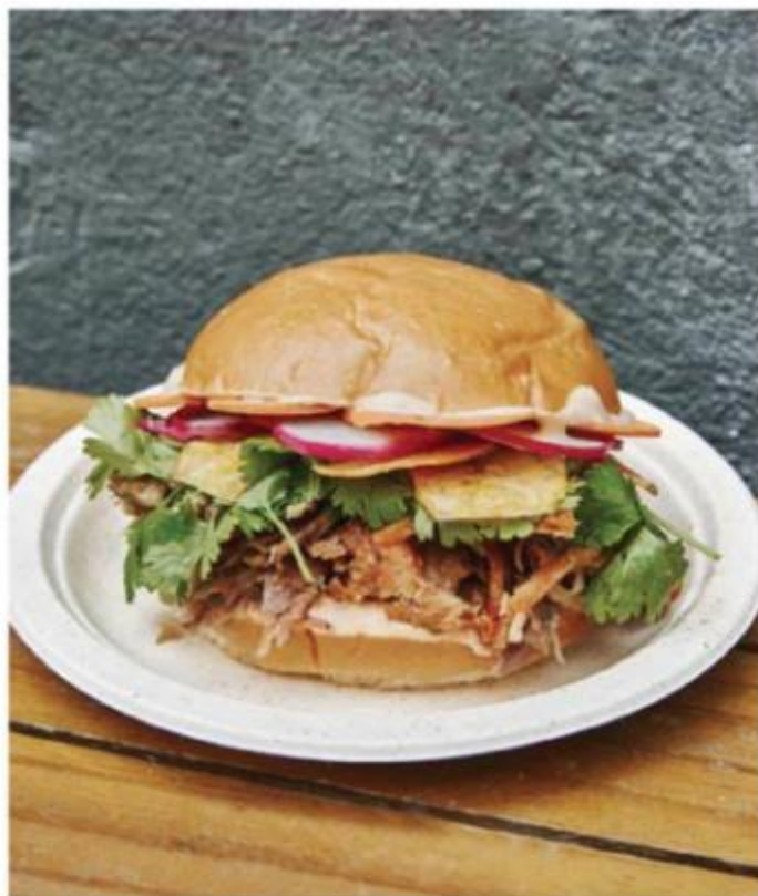
↑ The pernil-and-plantain-packed sandwich at Pernileria Los Próceres.