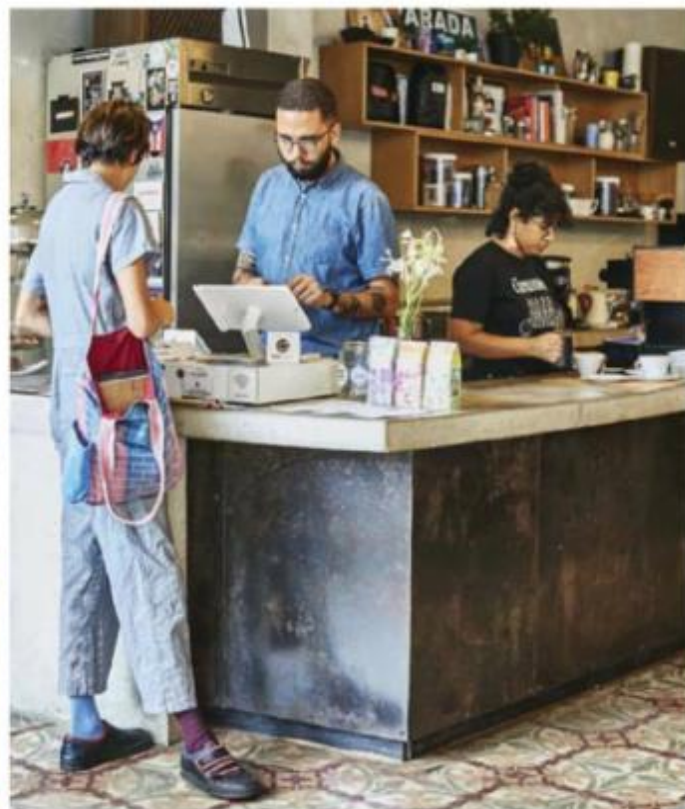
↑ At Café Comunción, the espresso is a sweeter Cuban style.